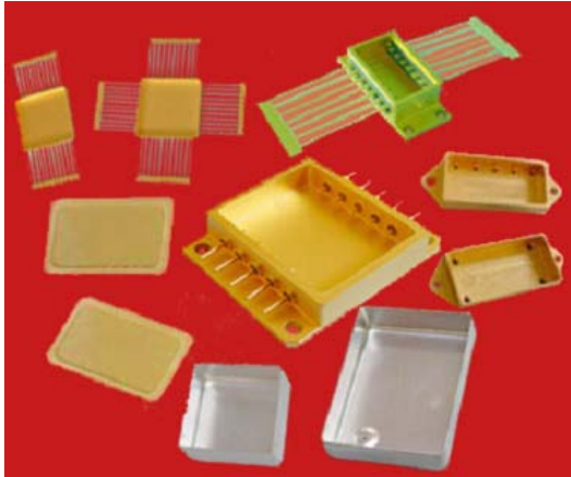
Hybrid and Wave Filter